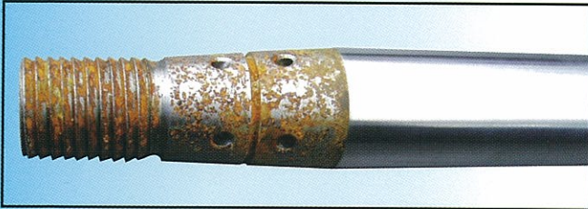
Comparative table of neutral salt spray test (According ISO 9227 NSS & ISO 10289)